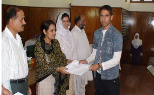
Chairperson Environmental Sciences Deptt, University of Peshawar awarding certificate to the participants