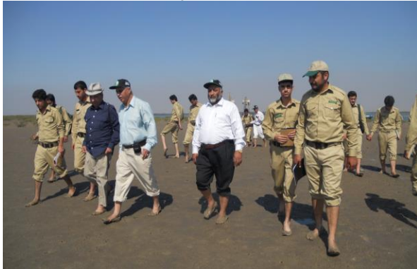
DG, PFI and DFE with students visiting mangrove plantation area at Karachi

Director General PFI and Director Forest Education PFI joined the students at Karachi and accompanied them on field visits to Karachi Safari Park and Mangrove forests.