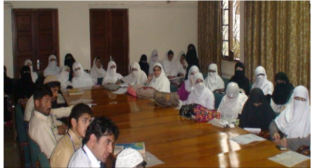
Participants of the training course

Habitat, Community Participation in Biodiversity, Trophy Hunting as a Conservation Tool etc. Besides lectures a field practical exercise on Bird watching techniques was also conducted.