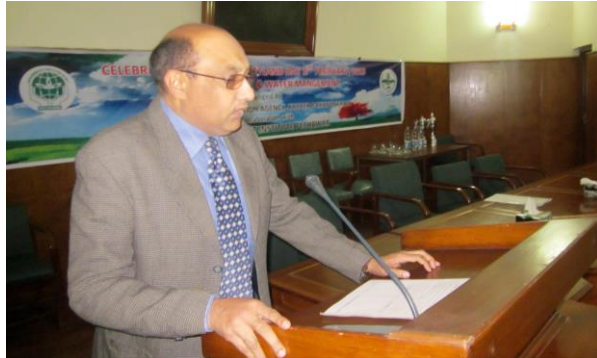
Deputy Conservator (Wildlife) delivering lecture

Moreover, tableau was performed by the students of Fazia Inter College and Zarif Memorial School highlighting the importance of Wetland day.