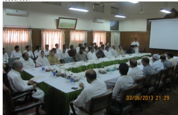
Participants of training course "Carbon Stock Assessment & REDD+"

A two week training course on "Carbon Stock Assessment and REDD+" was organized by Carbon Stock Assessment of Forests of Khyber Pakhtunkhwa Project (CSAFKP) on June 3-14, at Pakistan Forest Institute, Peshawar. The training course was inaugurated by the Director General, PFI. Addressing on the occasion, the DG, PFI welcomed the participants and highlighted the importance of the this training course. He said that forests play important role in climate change as they act as carbon sink as well as source of carbon emissions. REDD+ is emerging as a new opportunity for forest management. A key step in this forest carbon management is estimating the magnitude of carbon stocks and the rate at which carbon is sequestered by the forests. DG, PFI pointed out that there is great potential for Pakistan to utilize the REDD+ opportunity for conserving and enhancing its meager but highly valuable forest resources.