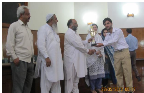
DFE is awarding first prize to the winner of the speech contest