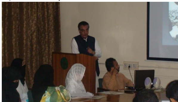
CCF Wildlife delivering lecture

Under the Forestry Sector Research & Development Project the Wildlife Management Branch of Pakistan Forest Institute has organized/conducted 2 (two) short training courses from 1 st to 3 rd April and 4 th , 5 th and 8 th April 2013 for the students of Zoology Department, University of Peshawar.