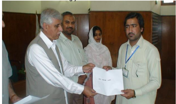
DG, PFI awarding certificate to the course participants

In his inaugural address he said that Pakistan Forest Institute is actively involved in the training on Forestry and Wildlife Conservation & Management. Moreover, he stressed the need of awareness raising and capacity building about natural resources and its conservation among youth and communities.