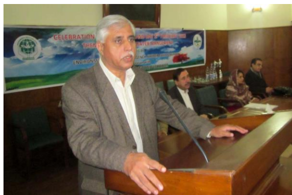
DG, PFI addressing the audience

Every year 2 nd February is celebrated as a world wetland day. It marks the date of the adoption of the convention on wetlands on 2 nd February 1971, in the Iranian city of Ramsar on the shores of the Caspian Sea. Each year since 1997, Government agencies, non-Governmental organizations, and citizens at all levels of the community have taken advantages of the opportunity to undertake actions aimed at raising public awareness of wetland values and benefits in general, and the Ramsar Convention in particular. The Theme for the year 2013 is Wetlands and Water Management.