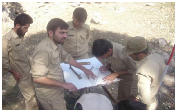
Students are busy in doing the practical work at survey camp

collected field data using different methods such as Chain Survey, Compass Survey, Plane Table Survey, Contouring and Forest Road layout and plotted it onto sheets. The DFE also visited the camp and inspected students work.