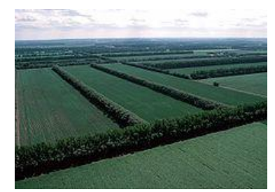
Aerial view of field windbreaks in North America

commonly planted around the edges of fields on farms. If designed properly, windbreaks around a home can reduce the cost of heating and cooling and save energy. Windbreaks are also planted to help keep snow from drifting onto roadways and even yards. Other benefit includes providing habitat for wildlife and in some regions the trees are harvested for wood products. A further use for a shelterbelt is to screen a farm from a main road or motorway, mitigating noise from the traffic and providing a safe barrier between farm animals and the road.